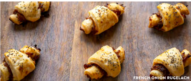
FRENCH ONION RUGELACH

Packaged in foil pans. Please note many of these items do not travel well hot. Minimum 2 dozen any type.