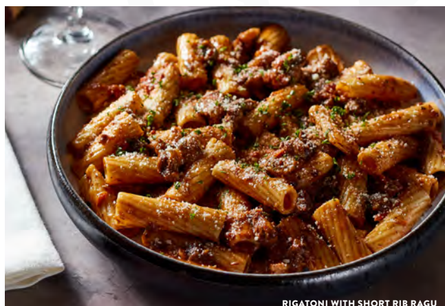
RIGATONI WITH SHORT RIB RAGU