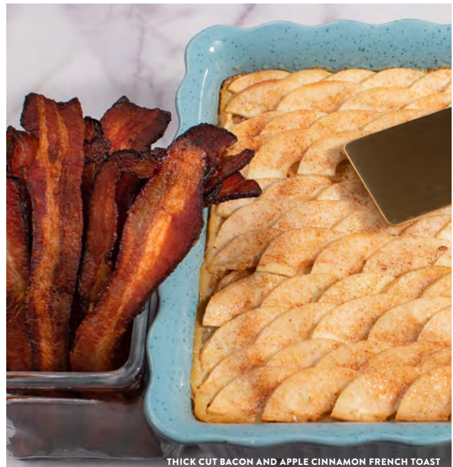
THICK CUT BACON AND APPLE CINNAMON FRENCH TOAST