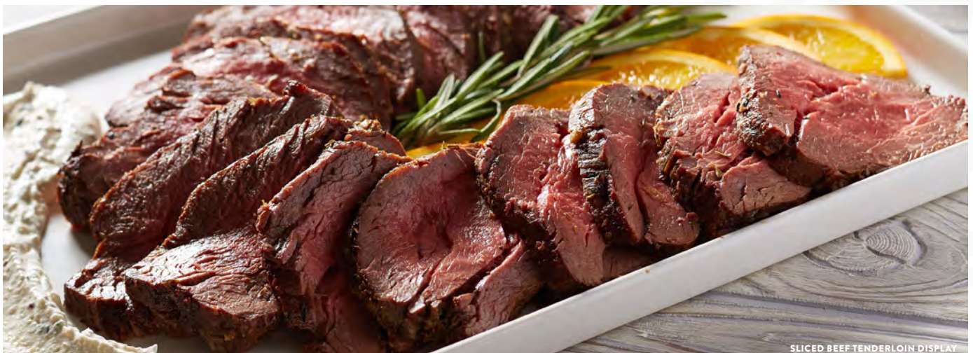
SLICED BEEF TENDERLOIN DISPLAY