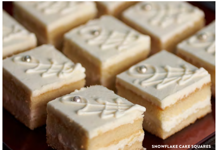
SNOWFLAKE CAKE SQUARES

HOUSEMADE FRESH MAPLE WHIPPED CREAM V | GF 16.85/qt