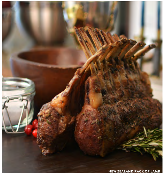
NEW ZEALAND RACK OF LAMB

HONEY GARLIC DIJON PORK LOIN GF Minimum 3lbs. 28.85/lb Glazed with caramelized honey and garlic and sliced to serve.