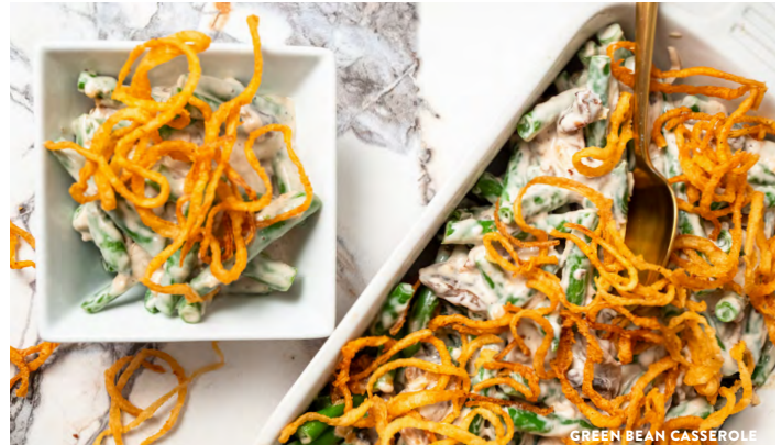
GREEN BEAN CASSEROLE