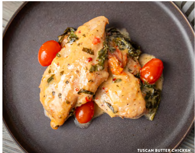
TUSCAN BUTTER CHICKEN