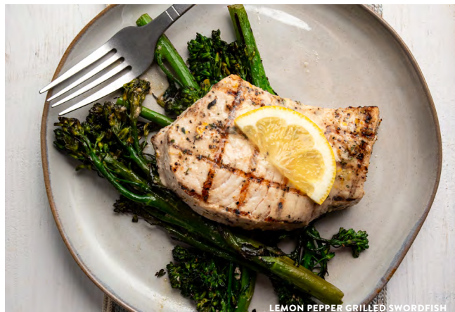
LEMON PEPPER GRILLED SWORDFISH

CRAB STUFFED SHRIMP Minimum 2 orders. 75.85 Butterflied colossal-sized shrimp stuffed with lump crabmeat, napped with lemon garlic butter. 6pc. 20% cooked.