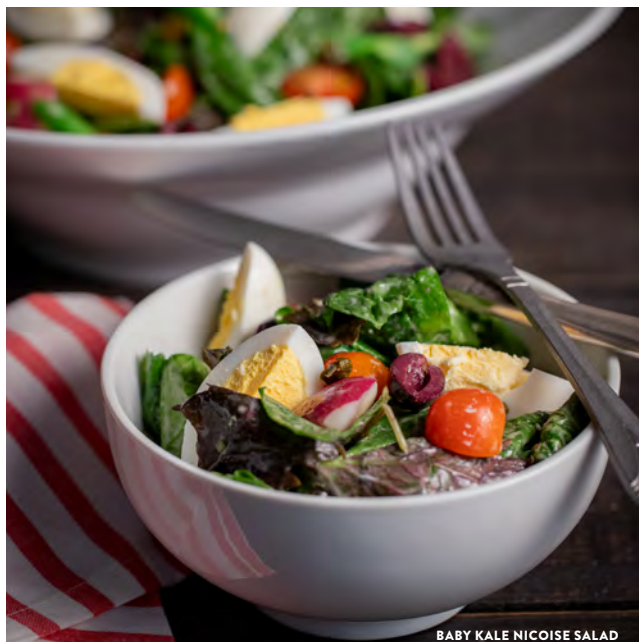
BABY KALE NICOISE SALAD