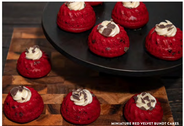
MINIATURE RED VELVET BUNDT CAKES