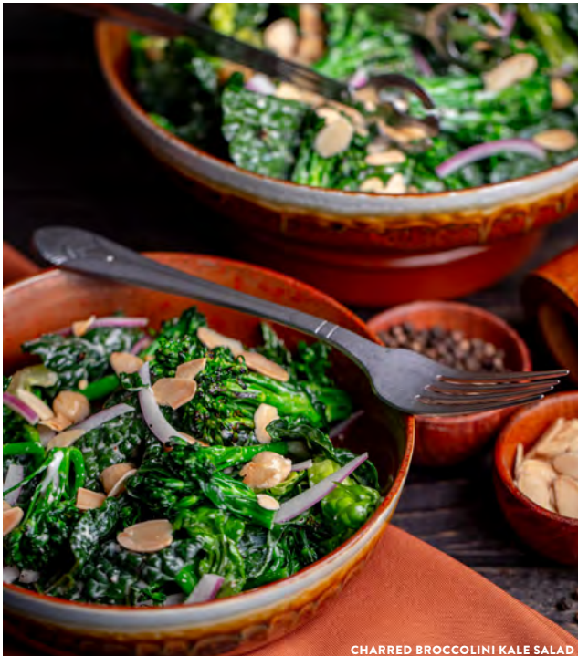
CHARRED BROCCOLINI KALE SALAD

*ZUPPA TUSCANA 19.85/qt Bacon, Italian sausage, russet potatoes, and Tuscan kale.