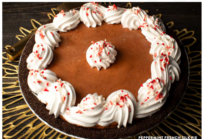
PEPPERMINT FRENCH SILK PIE