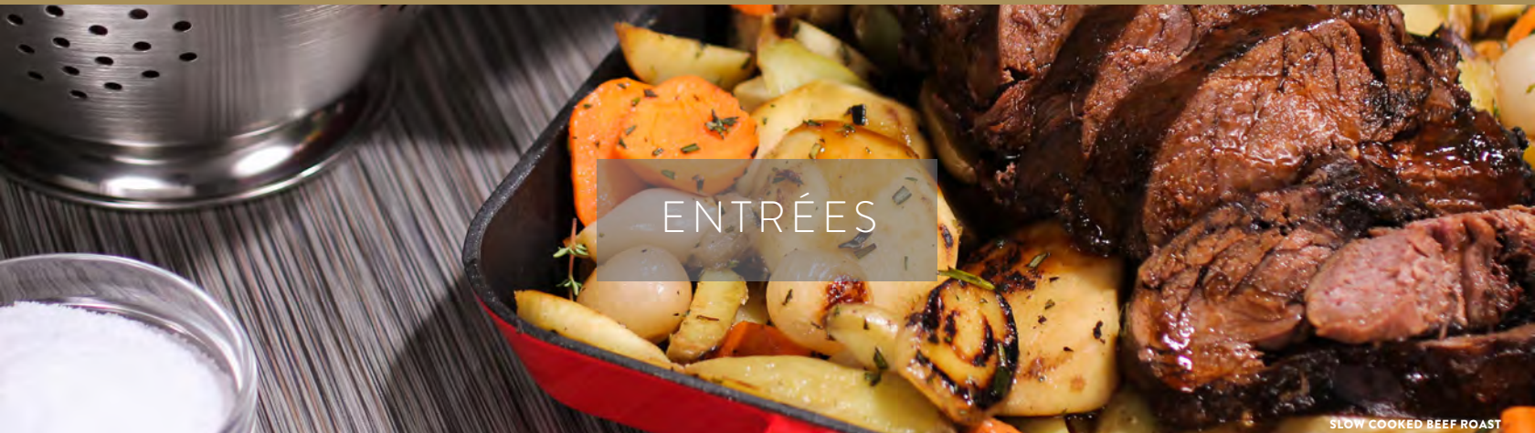
SLOW COOKED BEEF ROAST

* New Item V Vegetarian VGN Vegan N Contains Nuts GF Does Not Contain Gluten Ingredients