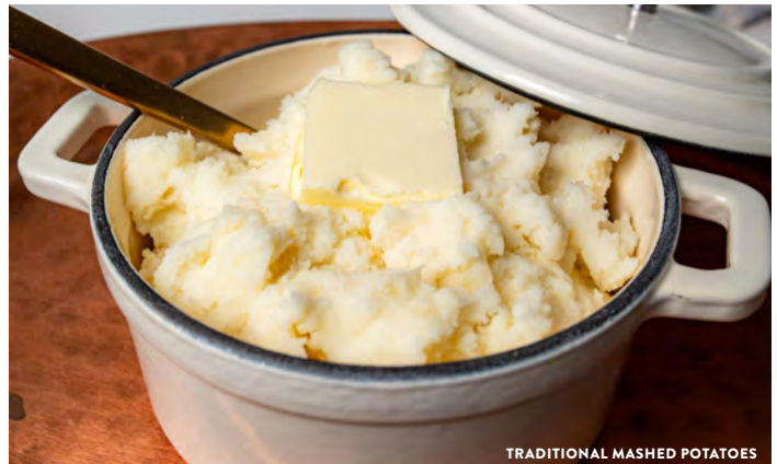
TRADITIONAL MASHED POTATOES