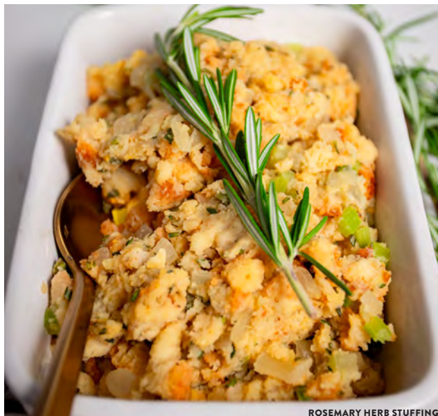
ROSEMARY HERB STUFFING

GLUTEN FREE & VEGAN STUFFING VGN | GF 28.50 2lbs; Serves 4-6.