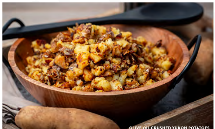
OLIVE OIL CRUSHED YUKON POTATOES