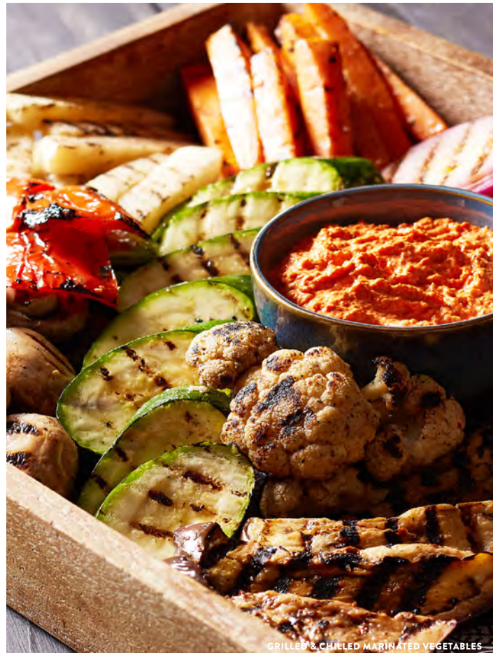
GRILLED & CHILLED MARINATED VEGETABLES