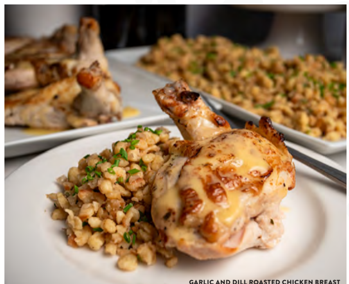
GARLIC AND DILL ROASTED CHICKEN BREAST