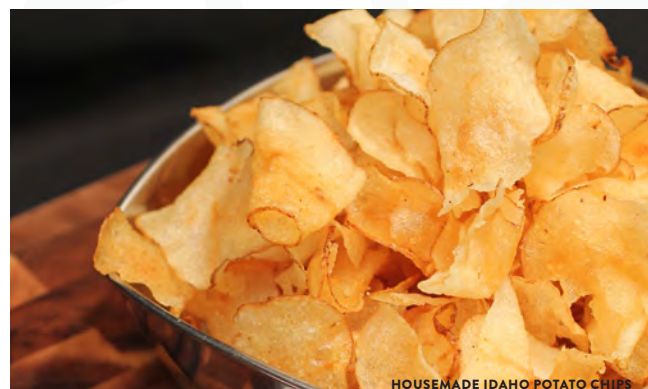
HOUSEMADE IDAHO POTATO CHIPS