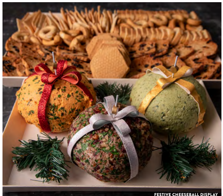
FESTIVE CHEESEBALL DISPLAY

BACON GOAT CHEESE FUNDIDO 62.50 With dates and crispy shallots. Served with herbed focaccia crostini. Serves 8-12.