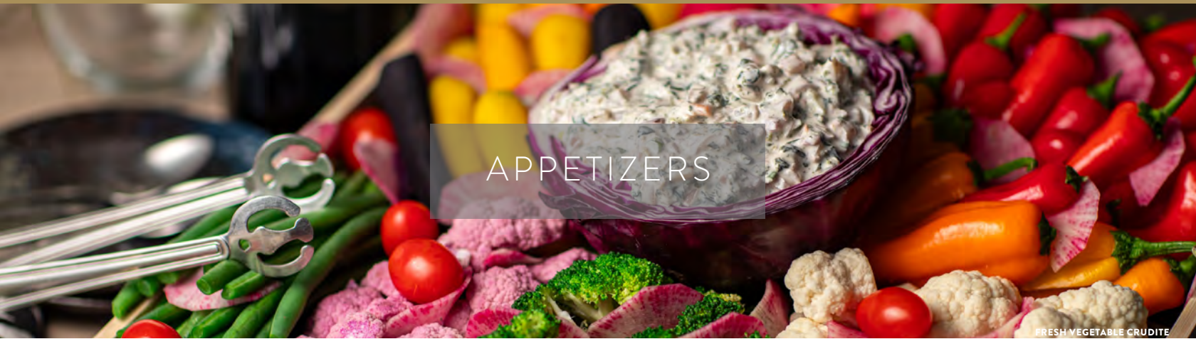
FRESH VEGETABLE CRUDITE

* New Item V Vegetarian VGN Vegan N Contains Nuts GF Does Not Contain Gluten Ingredients