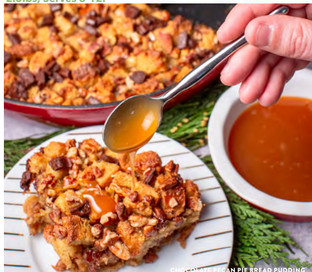
CHOCOLATE PECAN PIE BREAD PUDDING

WINTER CITRUS FRUIT DISPLAY V | GF 58.85 Sliced winter citrus fruits and chili lime jicama, garnished with pomegranate seeds and kiwi. 2.5lbs; Serves 8-12.