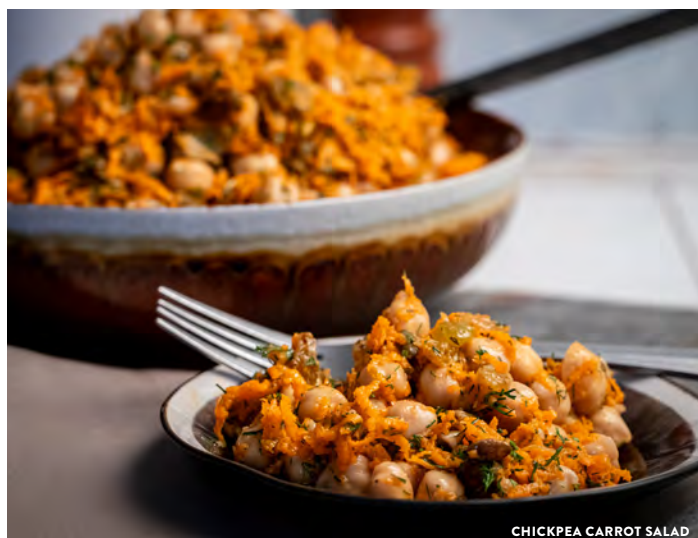
CHICKPEA CARROT SALAD