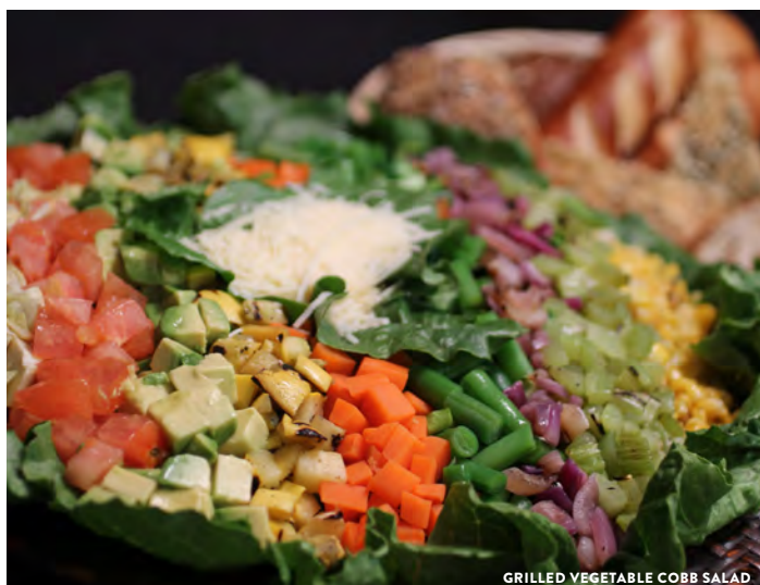
GRILLED VEGETABLE COBB SALAD

With julienned carrots, celery, onions, and radishes.