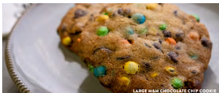
LARGE M&M CHOCOLATE CHIP COOKIE