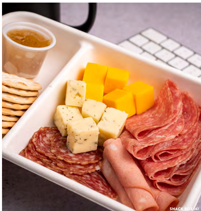
SNACK BOX (4)

Freshly baked New York bagel with Nova lox. Plain and chive whipped cream cheese packets, sliced tomato, shaved red onion, cucumber, and black olives. Housemade dried fruit granola bars N With dried apricots, cranberries, dates, toasted coconut, and almonds. Fresh fruit salad.