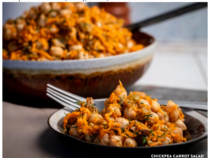
CHICKPEA CARROT SALAD