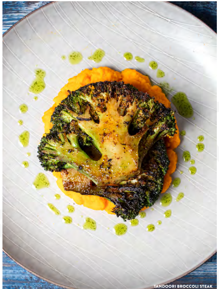
TANDOORI BROCCOLI STEAK