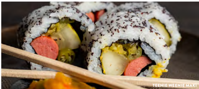
TEENIE WEENIE MAKI

SUMMER SKEWER DISPLAY (A) GF Minimum 4dz 38.95/dz Grilled adobo chipotle beef sirloin skewers with red pepper and pearl onion, cilantro lime marinated grilled shrimp skewers, and cilantro lime marinated grilled Brussels sprout skewers. Served with habanero chimichurri dipping sauce. Served at room temperature.