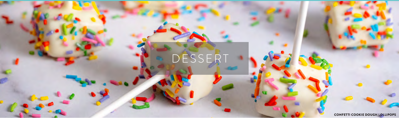
CONFETTI COOKIE DOUGH LOLLIPOPS

* New Item v Vegetarian vgn Vegan n Contains Nuts gf Does Not Contain Gluten Ingredients