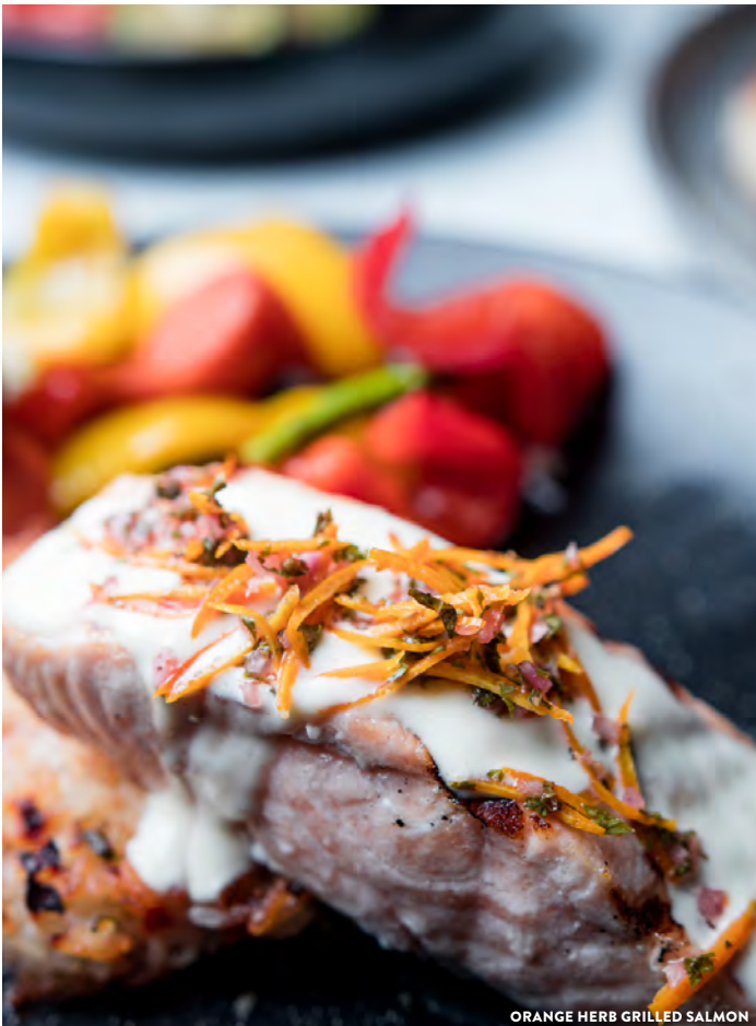
ORANGE HERB GRILLED SALMON