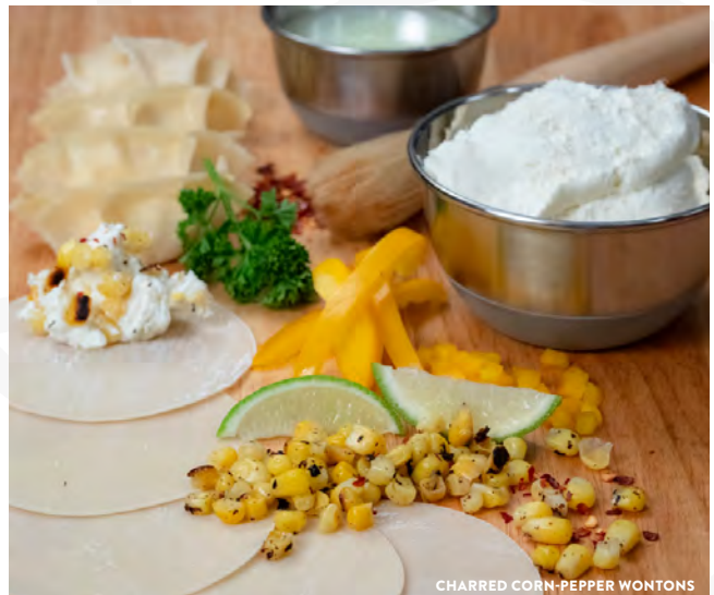
CHARRED CORN-PEPPER WONTONS