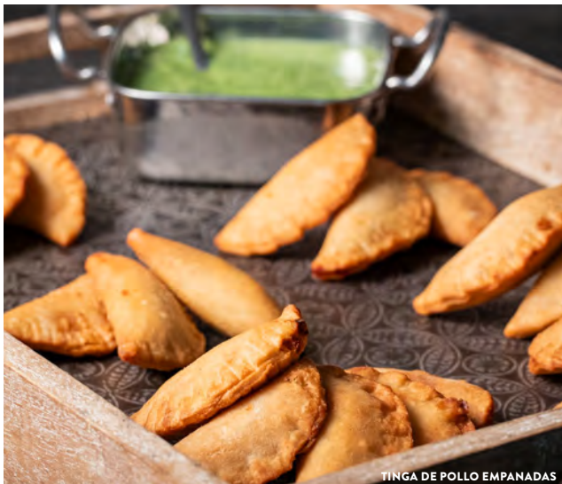
TINGA DE POLLO EMPANADAS