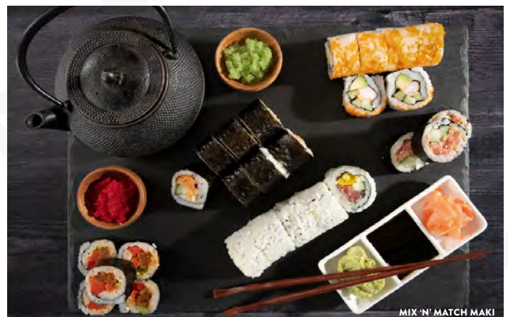
MIX 'N' MATCH MAKI