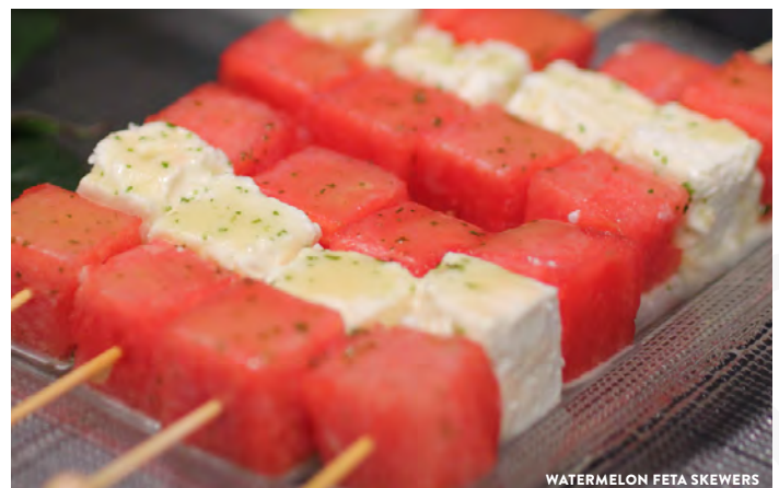
WATERMELON FETA SKEWERS